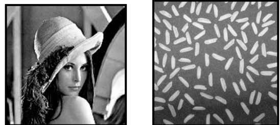
Lena Original image RiceOriginal image

The images are degraded with Gaussian blur where the value of (\sigma) will be chosen equal to 2 with the number of selected pixels = 3 and then with the number of selected pixels =7. Motion blur is also tested with the number of the shifted pixels = 4 and then with the number of the shifted pixels = 8 , both with shifting angle \theta =0 . While the Gaussian noise is imposed with \sigma_n =10 and then \sigma_n =15 . The noise density [s] for salt and pepper noise is chosen to be equal to (0.007 and 0.02).